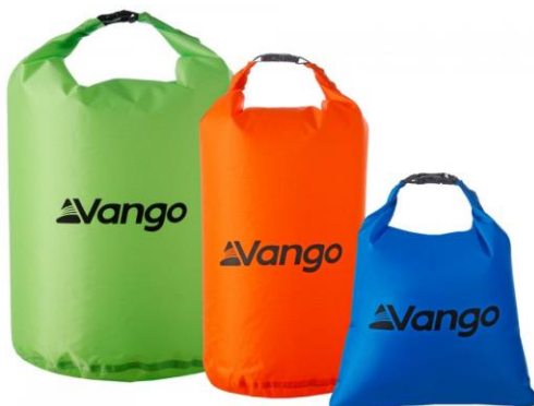
Vango Dry Bag Set

Protect all your travel essentials whether you're kayaking, cycling, trekking or climbing with Vango's Vango Dry Bag Set. We have created a variety of bag sizes to keep your equipment separated and designed them with tough, durable fabric to act as a perfect rucksack lining. The set is a perfect companion for worry free outdoor adventures!