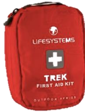
Lifesystems Trek First Aid Kit