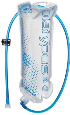
Platypus Hoser 2.0L